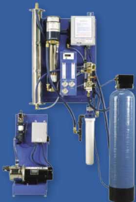
PurClean 2000 Wall-mount Spot-free System