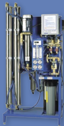
PurClean 6000 Stand-mount Spot-free System