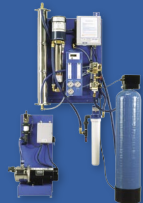
3,000 Gallons Per Day Wall-mount Spot-free System